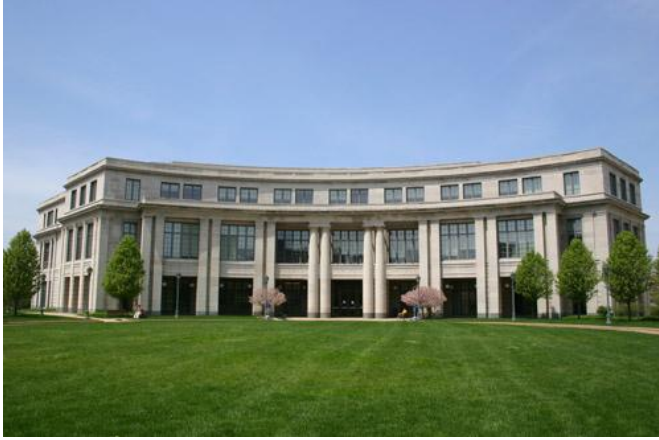
Kelvin Smith Library