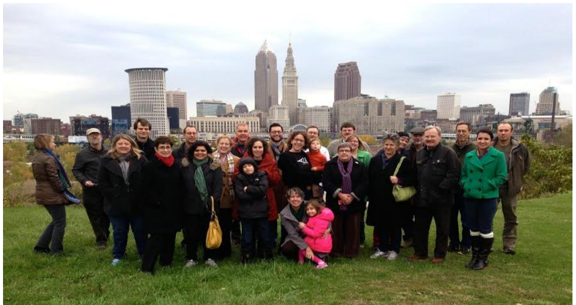
History tour-goers take a break from Lolly the Trolley for a scenic picture