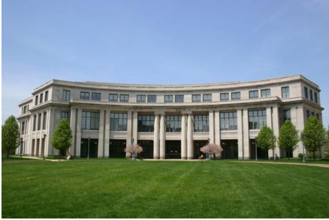
Kelvin Smith Library